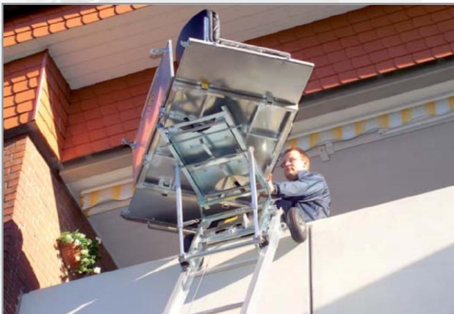
Furniture platform rotating and extendible