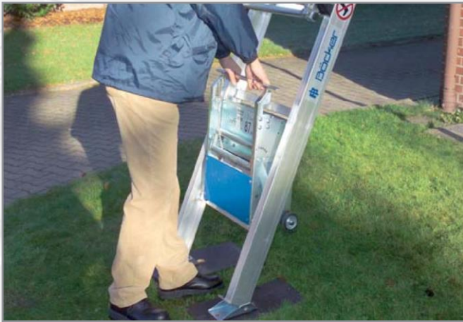
Easy hooking into the drive unit