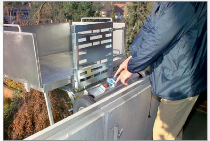
Operation via the headset*