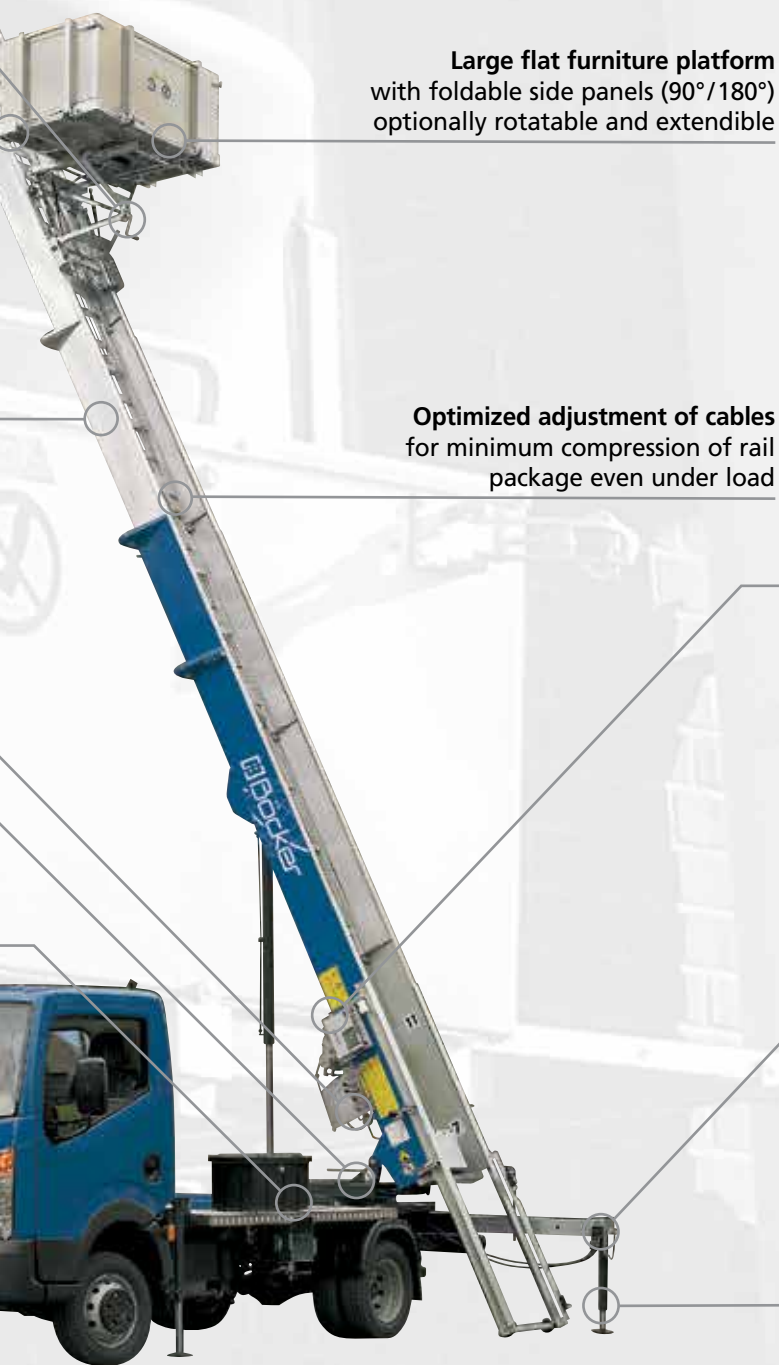
Large flat furniture platform with foldable side panels (90°/180°) optionally rotatable and extendible