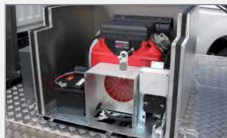
Extra powerful engines or PTO (depending on the model)