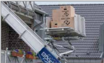
Infinitely variable, gas spring spindle 17 – 87° (optional)