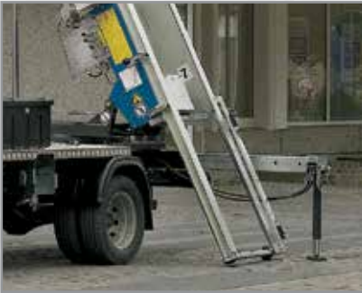
Infinitely extendable extension