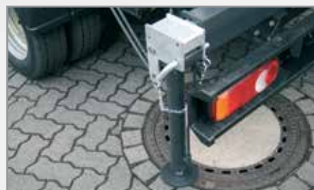
Hydraulic supports in two tubes