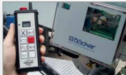
Hand-held radio transmitter for operation from the top end