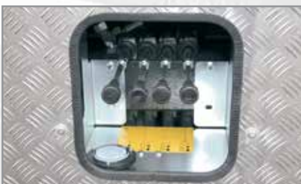
Control stand for hydraulic supports