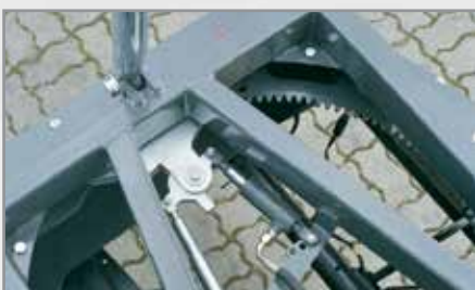
Infinitely variable, hydraulically releasable live ring lock