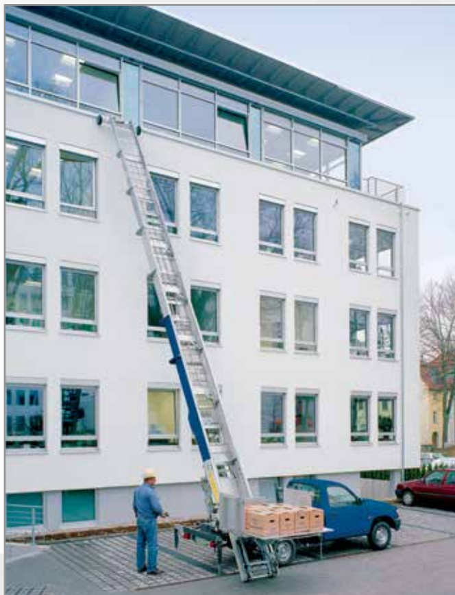
HL 26 on Pick-Up