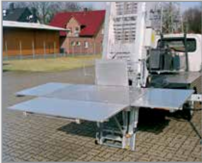
Completely plane platform surface