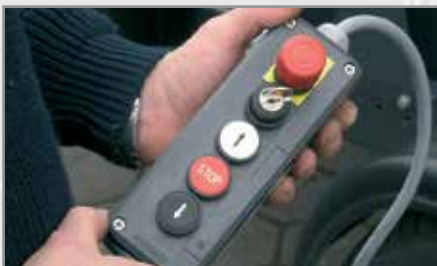
Electric control via cable operation