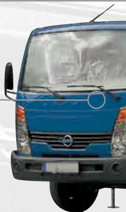
Tailor-made solution of lift and truck