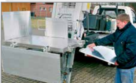
Side panels foldable 90° / 180° and completely removable