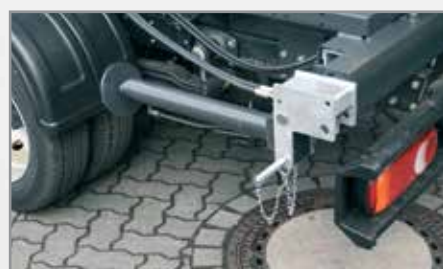
Hydraulic supports 90° foldable (transport position)