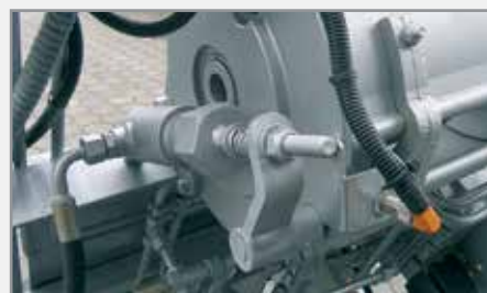
Automatic, hydraulic handle lock (optional)