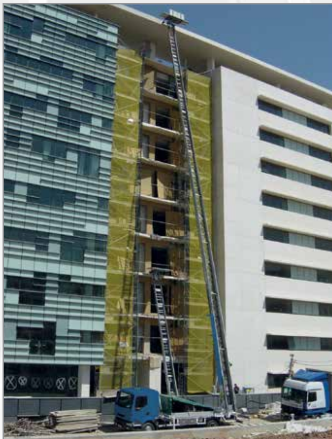
HL 42 on 8 t truck