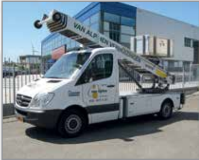
Rahmenverkleidung optional auch mit Werkzeugkästen