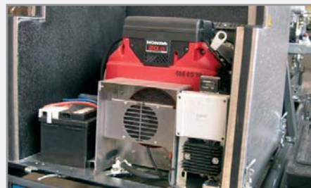
Extra powerful engines (e.g. Honda GX 620) with turbo switch