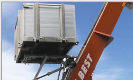
Infinitely variable, gas spring spindle 17–87° (optional)