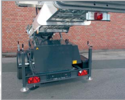
Integrated rear lights