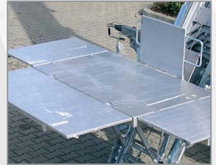
Completely plane platform surface