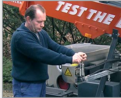
Operation panel for manoeuvring-drive