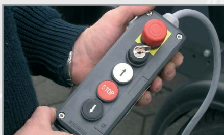
Electric control via cable operation