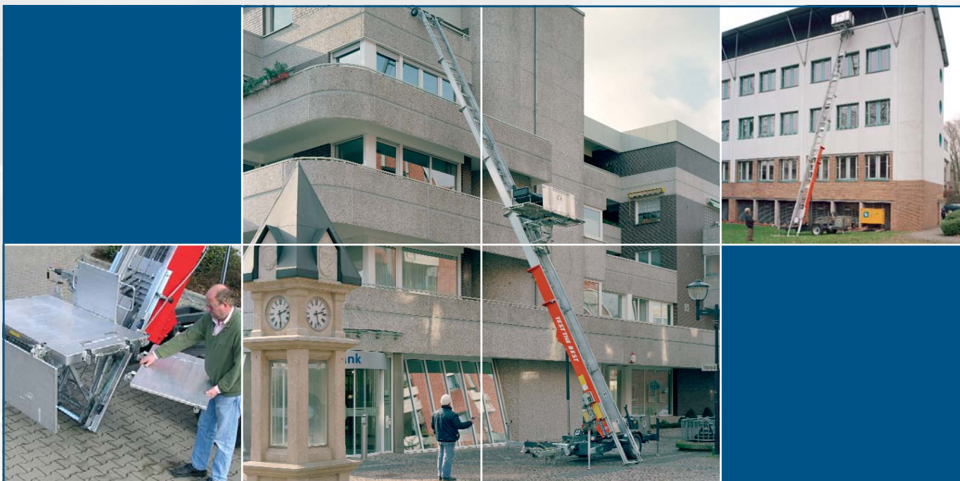
Arriva Furniture Lift