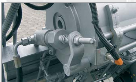
Automatic, hydraulic handle lock (optional)