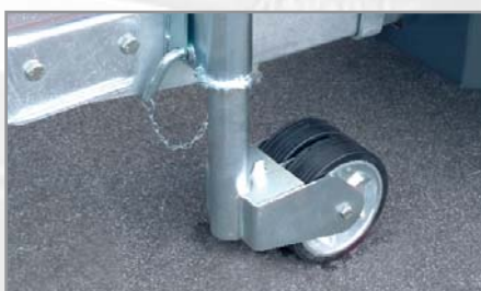
Solid support wheel (optional as double support wheel)