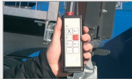
Hand-held radio transmitter for operation from the top end