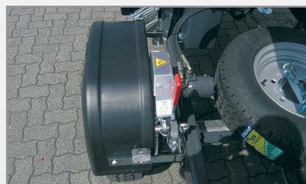
Powerful manoeuvring drive with positive connection (optional)