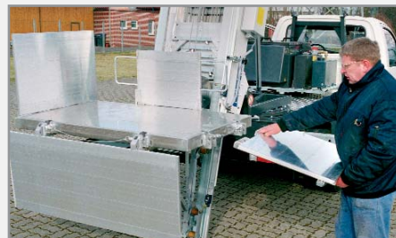
Side panels foldable 90°/180° and completely removable