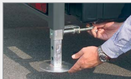
Zinc-plated crank outriggers with locking pins