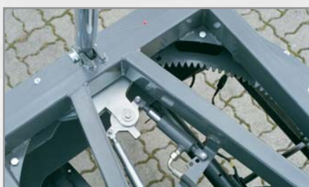
Infinitely variable, hydraulically releasable live ring lock