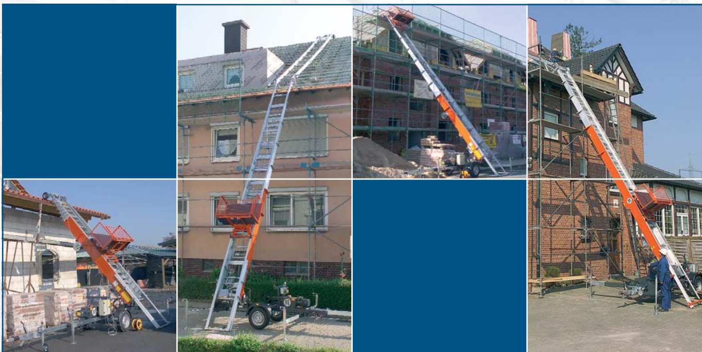
HD/K Lifts – Overview