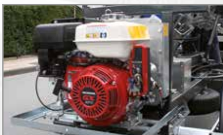
Petrol engine (optional)