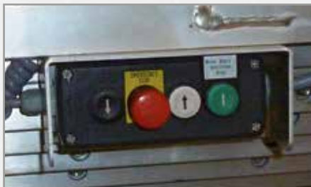
Electrical operation with creeping mode and Stop&Go function