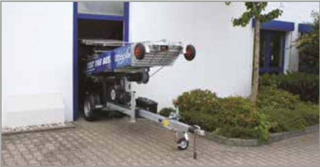
Fits even through a standard-sized door