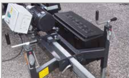
Amplify and lockable tool box