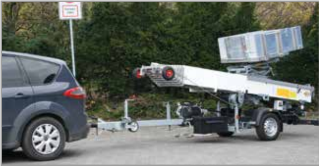
Can be pulled by any kind of passenger car