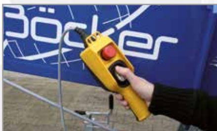
Electric pendant control operation from the base