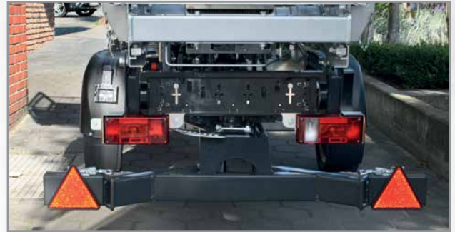
Integrated and protected lights