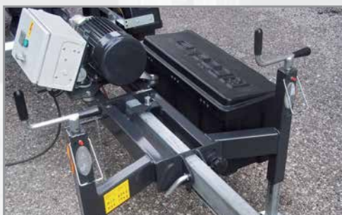
Large lockable toolbox

Wheels on the head piece movable at the side