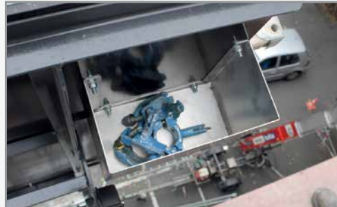
Platform equipped with storage trays for small parts

Scaffolding platform can be hooked directly into the rails without an additional carriage