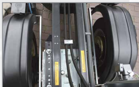
Retractable axle, manoeuvring width 0.89 m (optional)