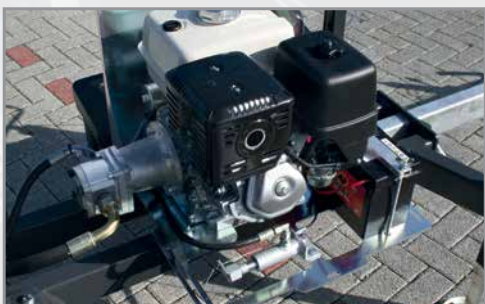
Petrol engine with electric starter (optional)