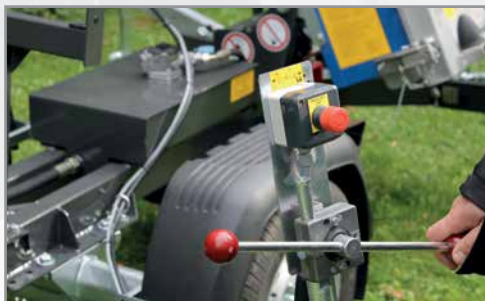
Mechanical remote control