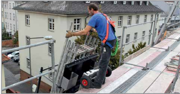
Easy and safe unloading of the scaffolding material