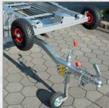
Drawbar with ball coupling permanently on the rails