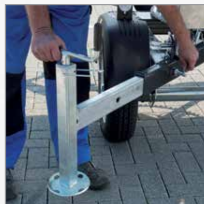
Extendable crank supports