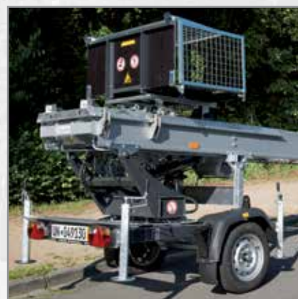
Compact chassis with integrated illumination