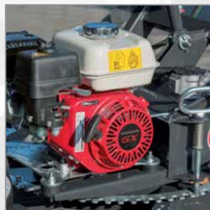
Drive via 230 volt electric engine or Honda petrol engine